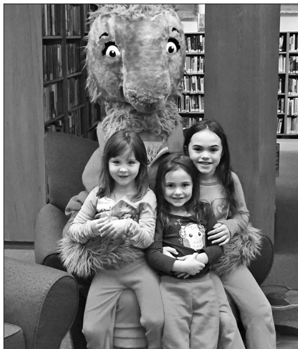
Storybook character Llama Llama visits with young friends.