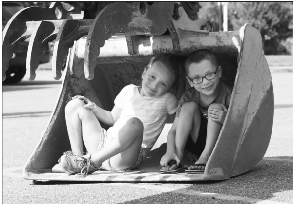
Youngsters enjoyed the library's Touch a Truck program in August.

The Edgartown Free Public Library ended 2015 amid preparations for its biggest move since the transition, some 110 years ago, from space above a shop on Main Street into the Carnegie library building that has served the town for all the years since then.