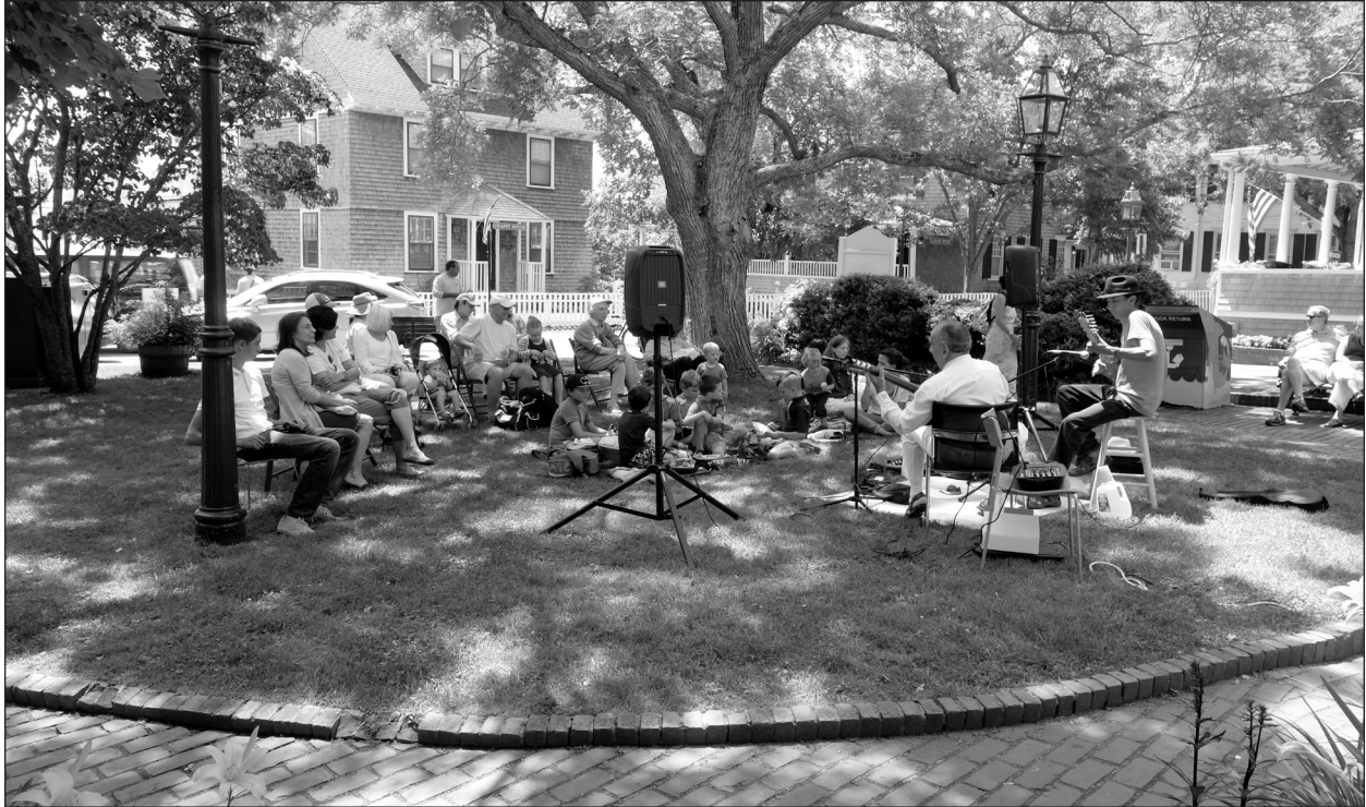
Families enjoyed their last season of summer music on the Carnegie Library lawn in 2015. This year the programs move to a new campus.

To the Honorable Board of Selectmen and the Citizens of Edgartown: