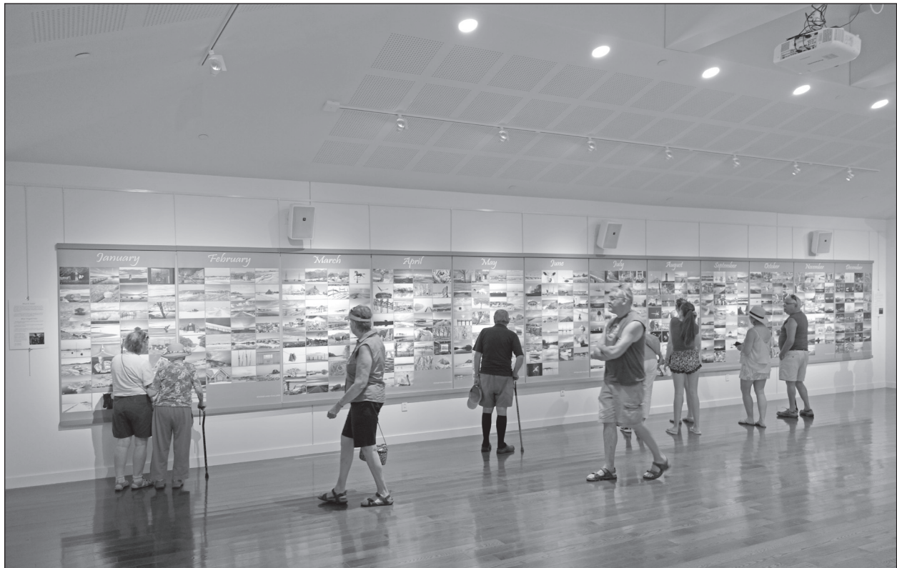
On the program room's gallery wall, a display of photographs by Vineyard Colors drew hundreds of admirers in the summer and fall of 2016.