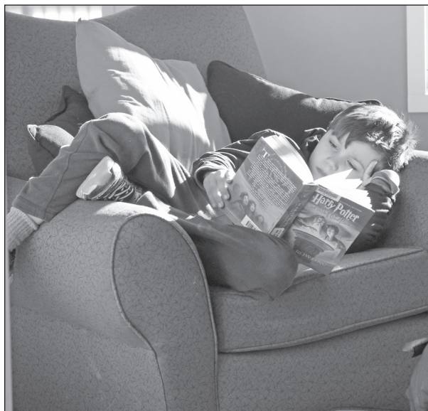
Curled up with a classic in the children's room.

the Edgartown Library provided funds for a small professional lighting system – it has already been used, most notably for live performances of dance in the new program room.