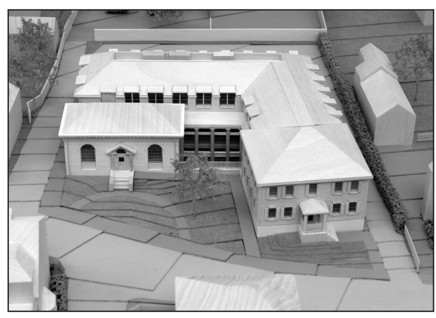
This model, on display in the library entryway, shows the design for the new Edgartown Public Library, which received the last of its needed permits from the town in 2007.

library's membership in CLAMS, the Cape Libraries Automated Materials Sharing network. CLAMS connects our patrons to the collections of some 30 member libraries, enabling them to request from nearly 1.5 million books, videos, music CDs and other resources. "Cheat-sheet" handouts on how to use the CLAMS network were posted in the library, and our staff held dozens of impromptu training sessions with