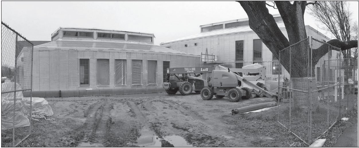
At year's end, the new library was being sealed to the weather so construction could continue through the winter and spring. At left in this image is the new children's room; the two-story structure at right is the main adult and young-adult portion of the library. Behind these, out of view here, is the library's new community program room.

and weekly drop-in crafts. Special children's events included the traditional celebrations of Valentine's Day, Chinese New Year and Mardi Gras/Carnival. Through the summer, the Children's Department presented weekly "Friday on the Lawn" events, and this year special appearances were made by two beloved characters from children's books, Lady Bug Girl and Biscuit the Dog.