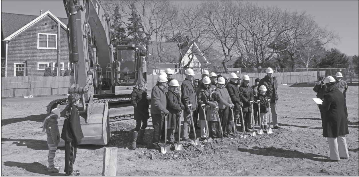
On the empty site where the elementary school once stood, Edgartown broke ground for its new public library in March.

To the Honorable Board of Selectmen and the Citizens of Edgartown: